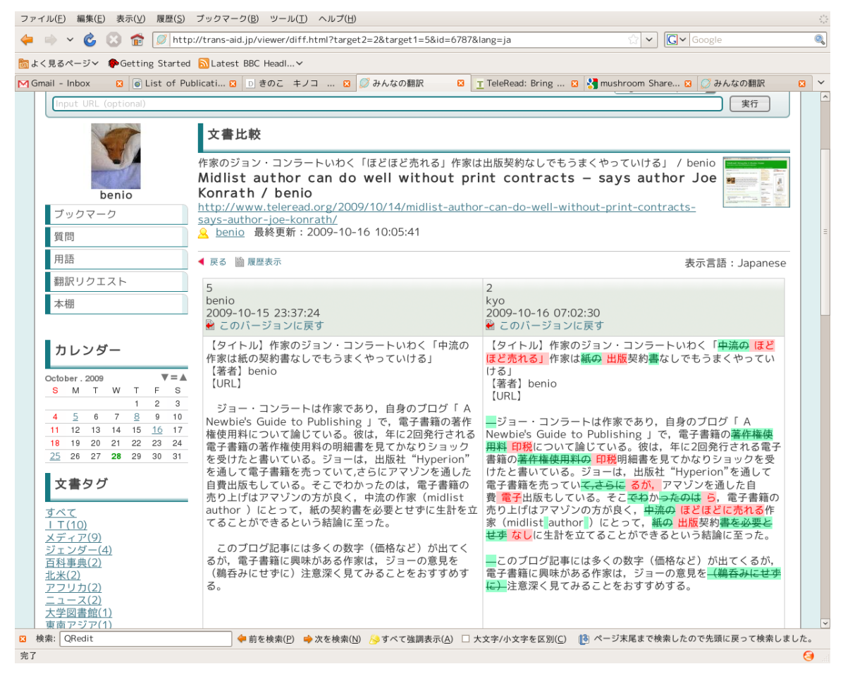
Figure 3. A comparative view of the draft and final translations

core, experienced translators become busier, leaving them no time to give advice to inexperienced translators, which further reduces the retention rate – a vicious circle. Thus mechanisms to enable inexperienced volunteer translators to train themselves are urgently needed. These mechanisms should be integrated into the process of translation to which they contribute as a volunteer; otherwise they cannot maintain enough motivation.