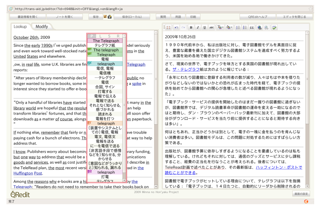
Figure 2. The integrated translation-aid editor environment QRedit

A series of search functions is provided, including the search of translation texts by content words or by tags, of translated text pairs (TM), of registered terms, of users, and of questions.