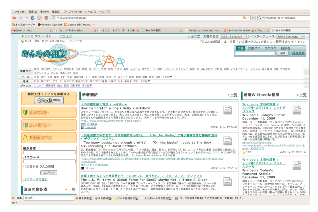
Figure 1. The MNH main page