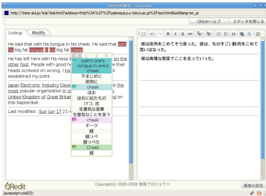
Figure 5: Screenshot of QRedit

(2) Given input texts, MT systems produce output translations without human intervention. This situation contradicts R3. Even if MT outputs are good translations, for now most translators are not ready to accept MT results as reliable, because they do not regard computers as communication partners. Thus, they want to decide on translations and control translation process by themselves.