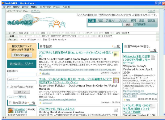
Figure 1: Screenshot of “Minna no Hon’yaku” site ( http://trans-aid.jp/ )

neers develop and distribute open source software. Our hope is that hosting services for volunteer translators could have a similar impact on the creation and distribution of translations.