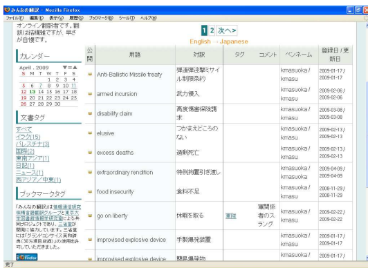
Figure 3: Screenshot of a term list