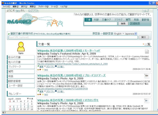
Figure 2: Screenshot of a personal page