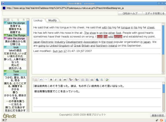
Figure 7: Customized QRedit window

with volunteer translators who are not working on a “time is money” basis but rather wish to reduce the subjective burden of translation, we carried out qualitative evaluations through e-mail and phone interviews with three users. They are trial users who have been using QRedit since before it was made public, thus have enough experience to give informed judgment on the system.